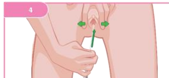
Standing in a comfortable position, use the free hand to spread the skin of the vaginal opening, while carefully inserting the swab up to the red mark.