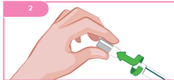
Twist and pull cap to remove the swab from the tube.