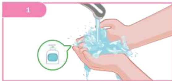
Wash your hands with soap and water before starting.

In the 2 days prior to self-collection of a vaginal sample, sexual intercourse and ultrasound scans or gynecological examinations should be abstained from.