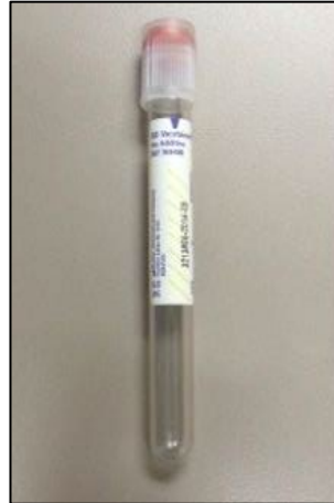
Urine Waste Tube