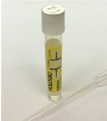
Urine Aptima Tube