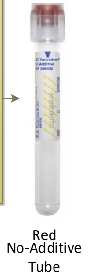
Red No-Additive Tube

Mix tubes by inverting (Refrigerate No-Additive tube or transport immediately)