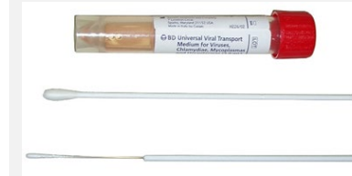
UTM SWAB KIT (RED OR WHITE CAP)

Acid-Fast Bacillus (AFB) Culture and AFB Stain (CXAFB) ASPERGILLUS GALACTOMANNAN AG BRONCH WASH (ASPGW) Bronchial Washing Culture, Quantitative (CXQBR) FUNGAL CULTURE (CXFUN) Mycobacterium tuberculosis/Rifampin Resistance PCR (TBRIF) Pneumonia Pathogen Nucleic Acid Detection Test (BALPC) RESPIRATORY CULTURE W/GRAM STAIN (CXRES)