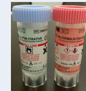
PARA-PAK PVA & FORMALIN VIALS

DO NOT USE FOR: C. DIFFICILE TOXIN PCR (CDPCI) – USE STERILE CUP IMMUNOCHEMICAL OCCULT BLOOD (IFOB) – USE OC-LIGHT S FIT STRIPS STOOL H PYLORI ANTIGEN (HELO) – USE STERILE CUP WBC SMEAR (WBCSM) – USE STERILE CUP