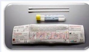
ROCHE COBAS PCR SWAB

CHLAMYDIA/GC PCR-GENITAL (CTNGG) CHLAMYDIA/GC PCR-RECTAL (CTNGR) CHLAMYDIA/GC PCR-THROAT (CTNGT)