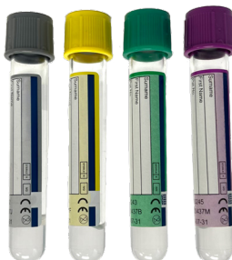
QTBG KITS (4 Tubes)