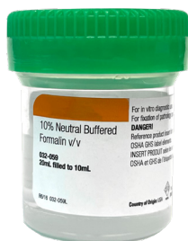
FORMALIN BOTTLE (10 ml)