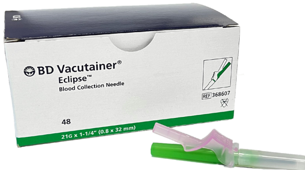
21g SAFETY (GREEN)