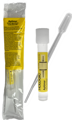
CHLAMYDIA GC (Urine)