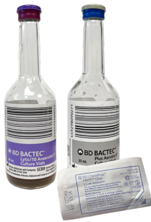
BLOOD CULTURE KIT