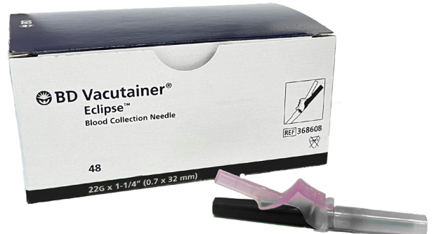
22g SAFETY (BLACK)