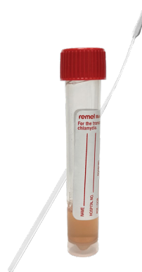
HSV/CULTURE KIT (M4RT/Swab)