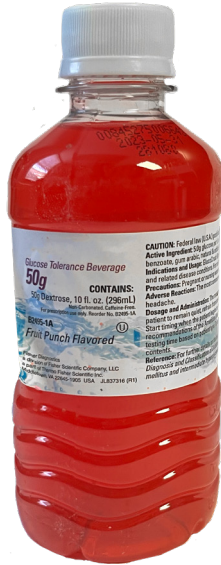
GLUCOSE TOLERANCE BEVERAGES (50g)