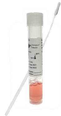
CHLAMYDIA/UREA MYCO (UTM/sawb)