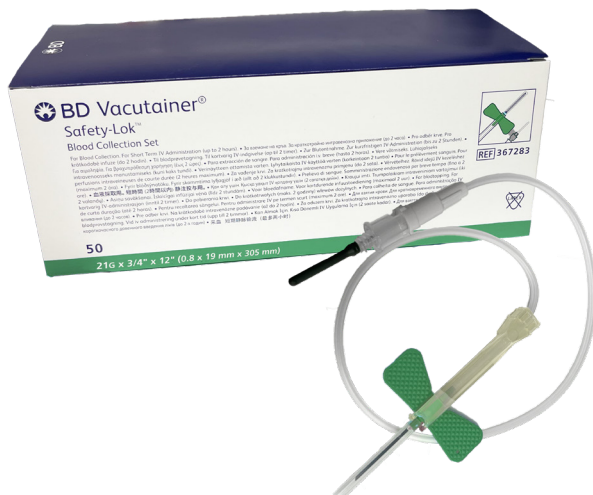
21g BUTTERFLY (GREEN)