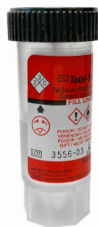
STOOL TOTAL FIX (Black Vial)