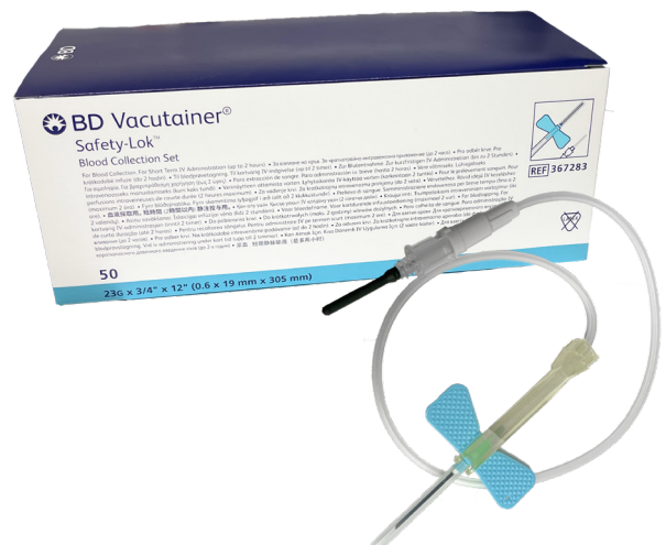
23g BUTTERFLY (BLUE)