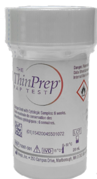
THIN PREP VIALS