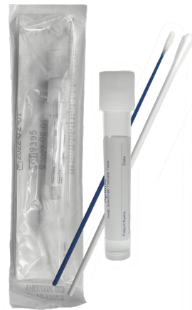
CHLAMYDIA GC (Endocervical/Urethral)