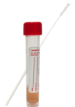
RESPIRATORY PANEL KIT (M4RT/NP Swab)