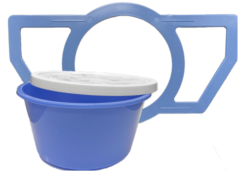
STOOL COLLECTOR (Bowl/Lid/Tray)