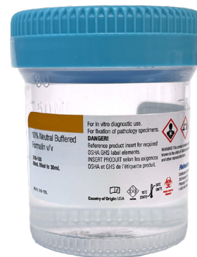
FORMALIN BOTTLE (30 ml)