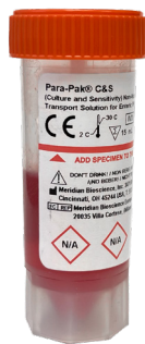
STOOL C&S (Orange Vial)