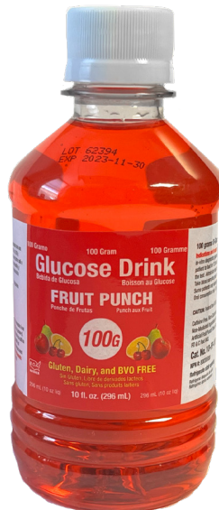
GLUCOSE TOLERANCE BEVERAGES (100g)