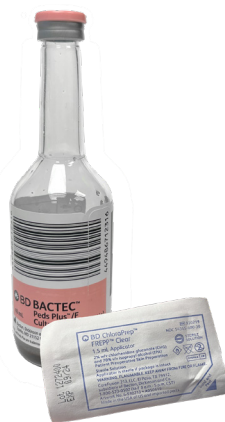
BLOOD CULTURE KIT (Pediatric)