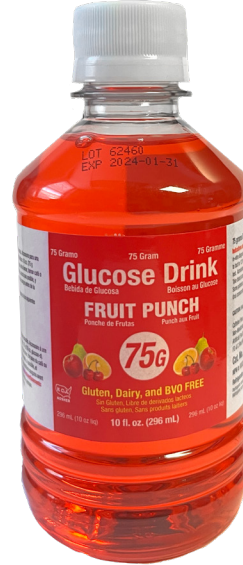
GLUCOSE TOLERANCE BEVERAGES (75g)